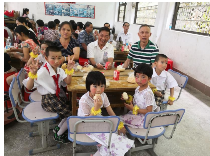
Smile for the camera