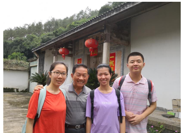
Smiling after Gaokao – Uni Entrance Exam