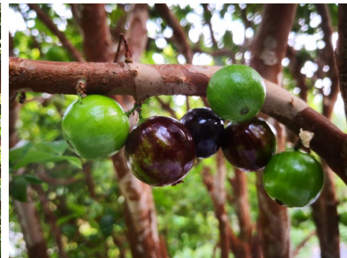
after 7 years care