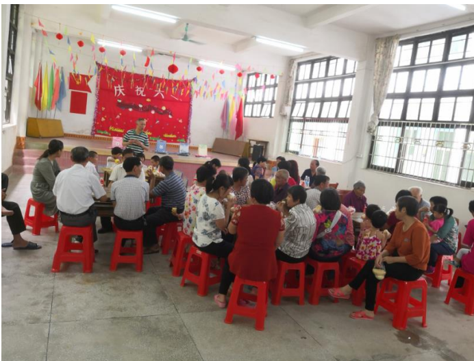
All guests sharing a morning break