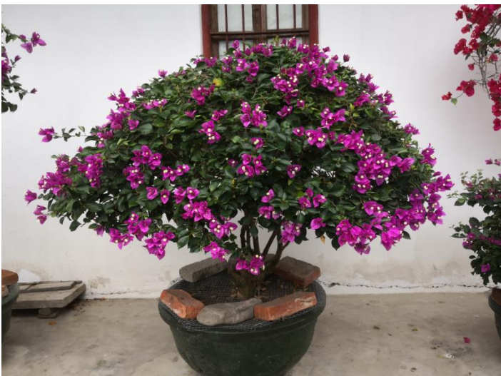
Bougainvilleas - in Hakka – 3 Corners Rose