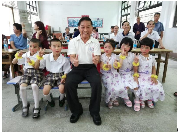
BD with the last 5