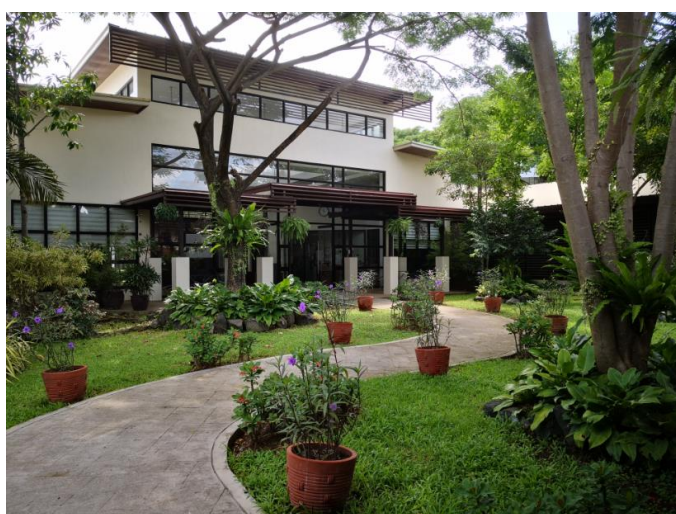
De La Salle Residencia

The extreme drought early in the year combined with the heavy daily rainfall in late March had affected the flowering season of the pomelo trees. Most farmers, when putting pomelos into wrapping bags in early June, found that the number of fruits was just 2/3 of last year's, that is a decrease of 30%. They are praying for better price this year as many orchards around us are having even lower percentage of fruits on their trees. Let's hope the law of supply and demand will push the price up this year. Wait and see!