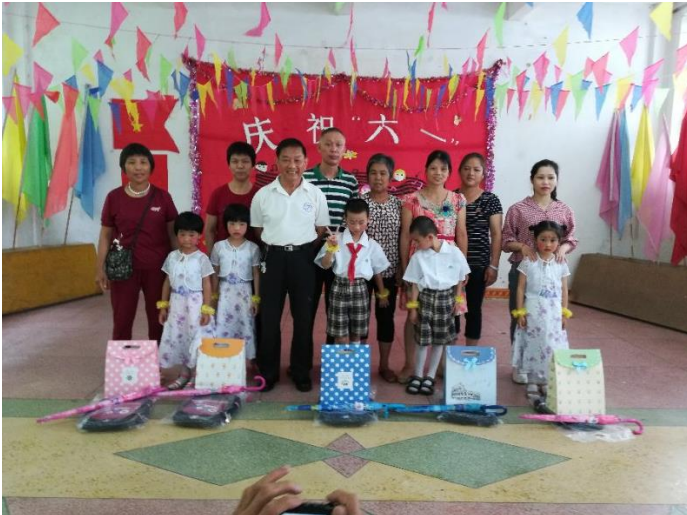
The 5 students with their parents