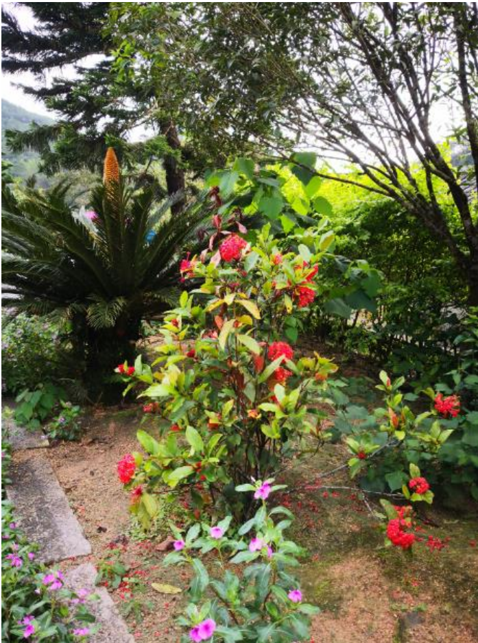
Iron palm trees