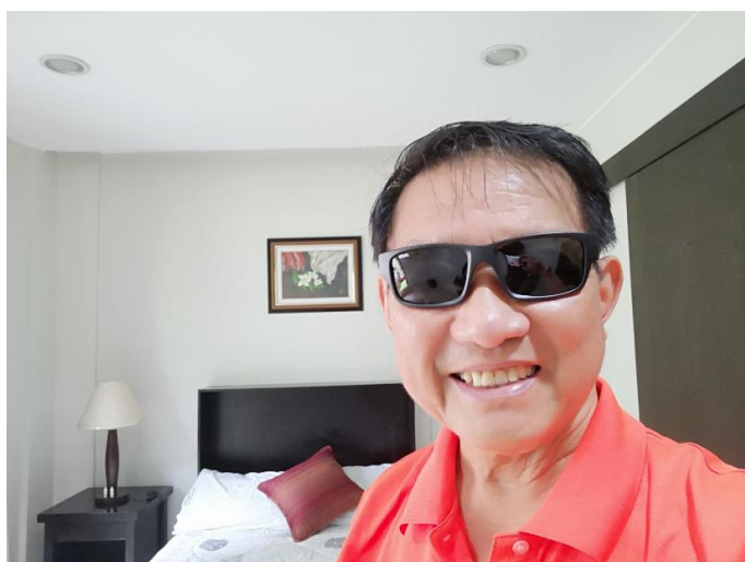
BD ... cataract removed

After being warded a week for medical examination and observation, the three highs are deemed alright with just a slight change of Blood Sugar medicine. The cataract on my left eye was successfully removed. A minor surgery was done to remove lipoma from my right arm. For the prostate condition I was advised to undergo oral medication with hormone injections. Thank God, all went off smoothly. I should be able to return to Hongkong on 18 th July and be back to LSSC Changjiao to run morning English tuition classes in August. It is not going to be like the regular Summer Programme which runs the whole day ... lessons in the morning – small groups tuition in the afternoon – activities and show at night ... and with 40-60 volunteers staying in at LSSC served by a 5-6 persons kitchen staff. Students and parents are already inquiring via WeChat ... so far and yet so near. Just a click away!