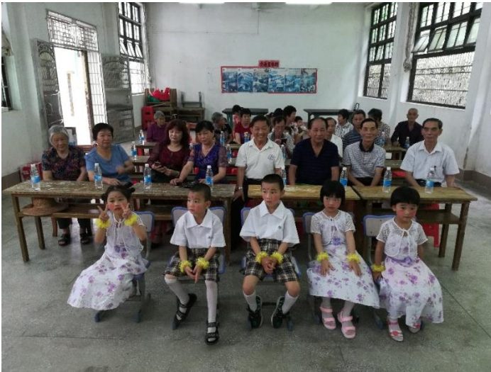
One for the record