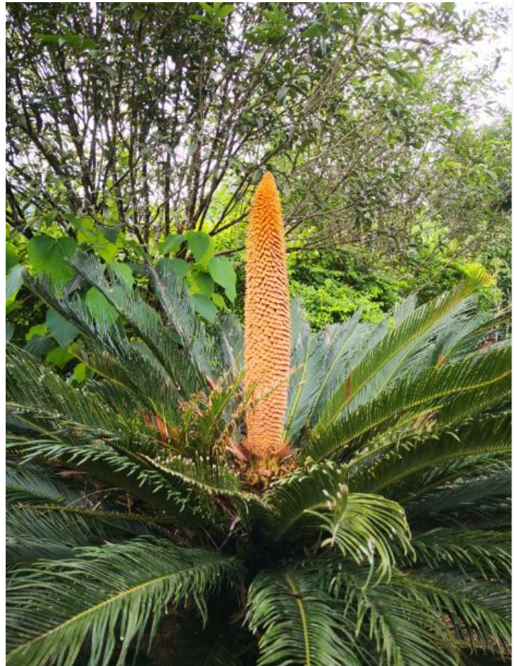
flowering every year