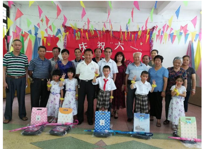
Villagers supporting the school