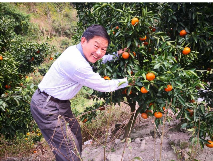
Picking Winter Oranges