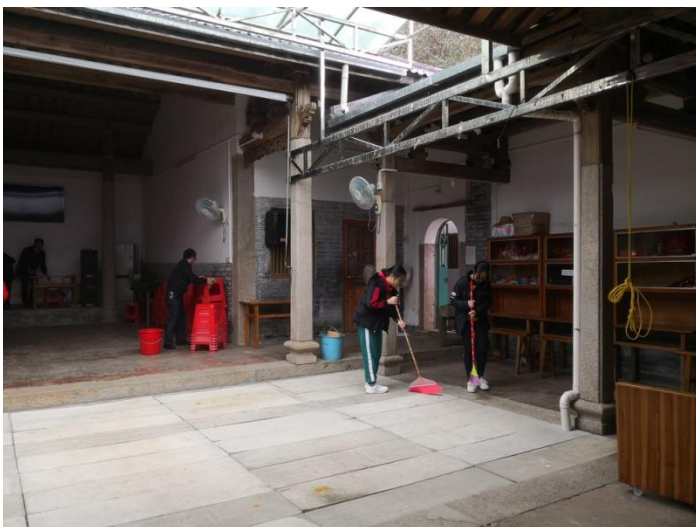
Cleaning and tidying up LSSC

I flew back to Hongkong on 9 th January and on 15 th January I returned to LSSC Changjiao so that I could make preparations to run the Winter Programme from 23 rd January to the 1 st of February. A few parents and students came 4 days earlier and they helped me clean and tidy up LSSC. Three university students, three junior high school students and a primary student came on 21 st to assist me. A village restaurant owner offered to give us a free dinner that first evening so we had time to wash, clean and tidy up the dormitory and kitchen. After dinner I drove three of them to a supermarket in Huliao to buy whatever they needed to prepare breakfasts, lunches and dinners.