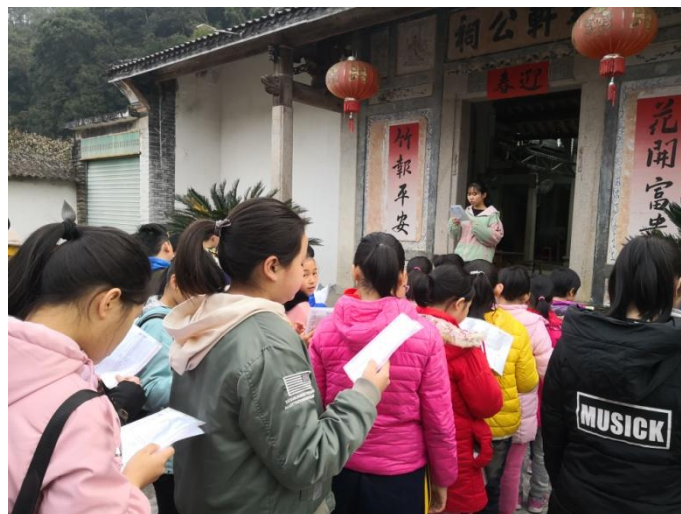
at Assembly before Lessons