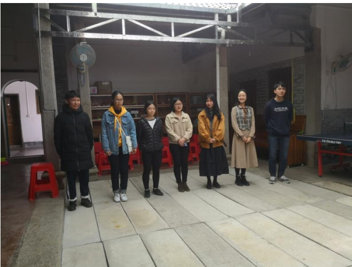
Who will begin ...