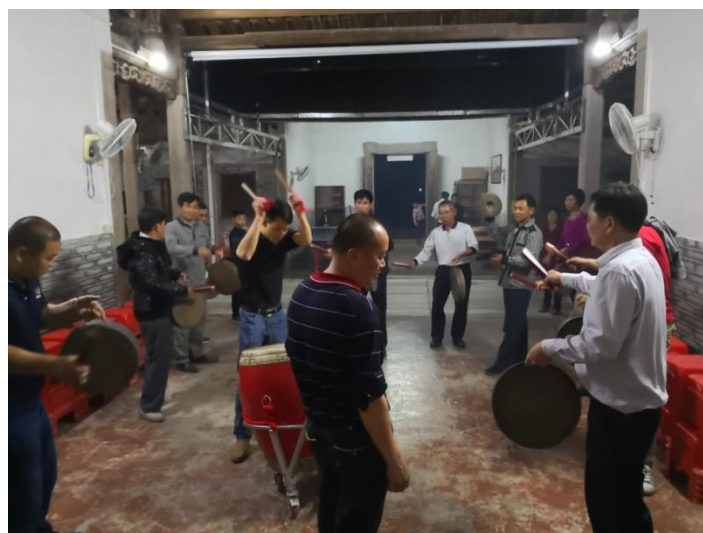
to welcome the New Year