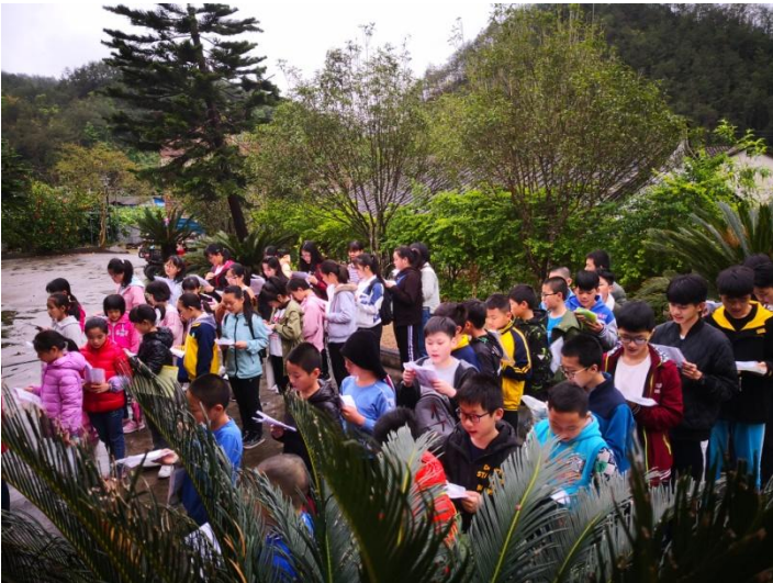
Weekends students assembly

On the 2 nd of March we resumed our weekend lessons. Once again, I did not arrange for direct bus service to LSSC for the weekend lessons. I opened the lessons to all who turn up. Students attendance and transport to and from LSSC becomes the sole responsibility of parents. This seems to be a better approach and since then we have been running one junior class, a senior class and a ukulele class. For those who are new to Pinphonics, they can begin learning at 7.30 a.m. Two of my regular students taught the Basic Sounds in the assembly area. I taught the regular Class A lesson from 8 a.m. to 9 a.m. and the emphasis was on pronunciation and reading. In between they sang our grammar songs. Class B and C was from 9 a.m. to 10.30 a.m. and the lessons were on making statements based on our Structural Grammar approach and asking and answering questions. The Ukulele lesson was from 10.30 a.m. to 11.15 a.m. The last public bus to town for the morning passes by at 11.30 a.m.