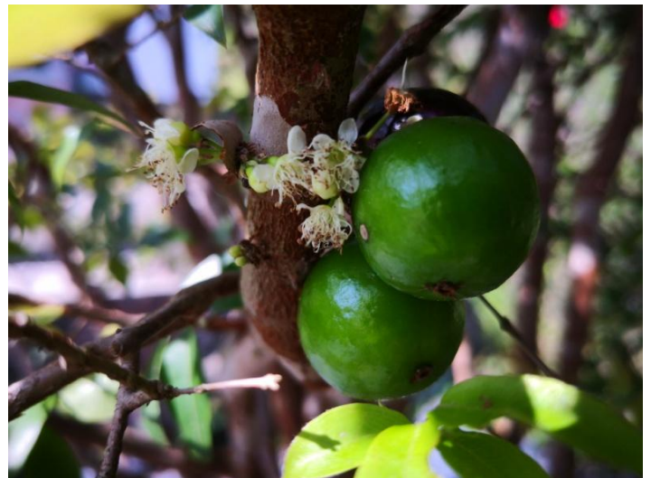
My grape fruit tree - Jaboticaba