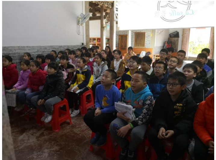
Looking up and Reading aloud

As I write this report, tomorrow is the last weekend lesson for the first half of this year. I leave for Hongkong on 14 th April and will fly back to Malaysia on 15 th April to be in time for the Malaysia Brothers Holy Week and Easter Retreat and at the end of April I go to Thailand for Brothers' LEAD 3 rd District Chapter. LSSC will resume classes in early June followed by the Summer Programme in mid July and August.