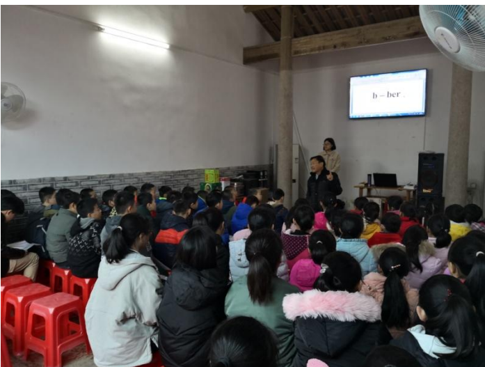
BD Welcomes students