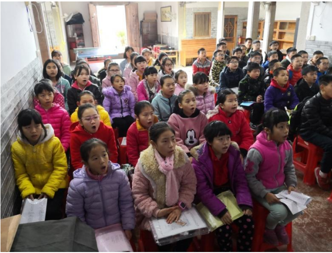
Class A students attentively ...