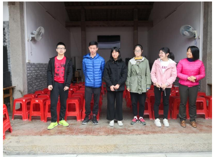
OK ... I speak first.