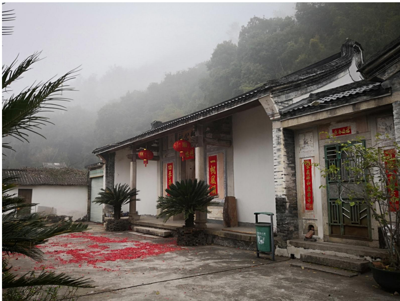
LSSC on Chinese New Year morning ...all red after firing fire crackers