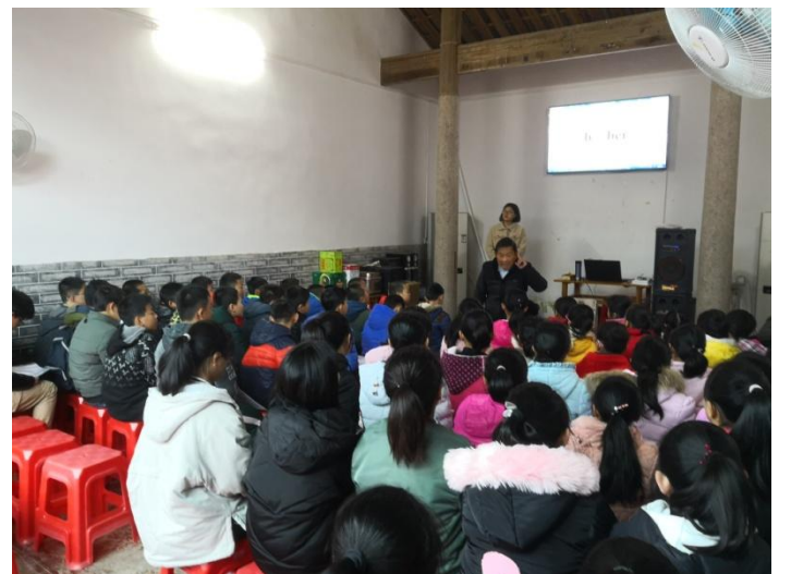
It is important to listen well