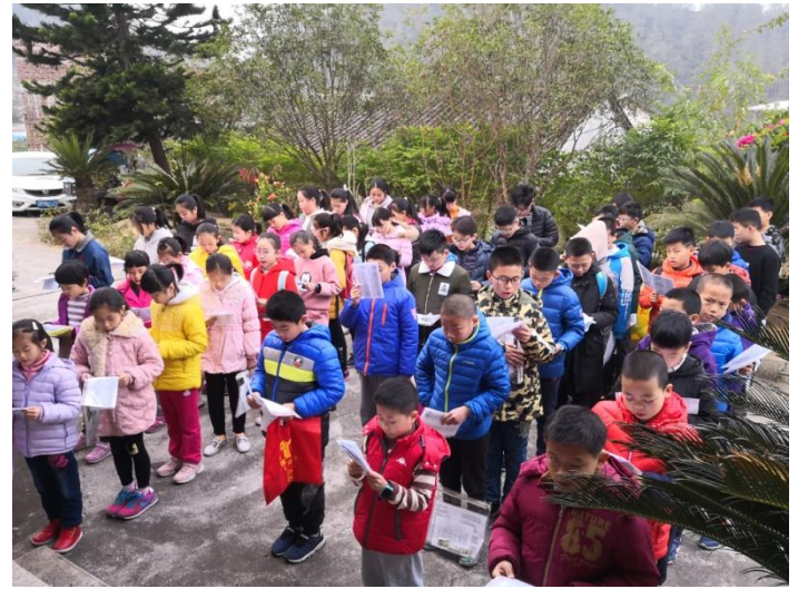
Reading before lessons begin