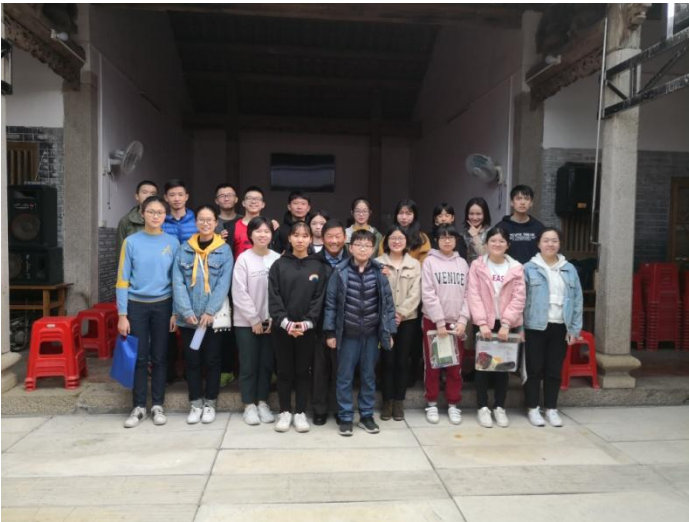
Class C students