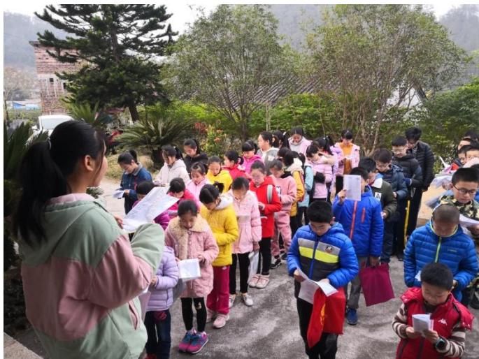
Reading PinPhonics Sounds

Anyway, despite the low key approach, we had 60+ students for Class A (Primary Students), 40+ students for Class B (Lower Secondary) and 20+ students for Class C (Upper Secondary and University).