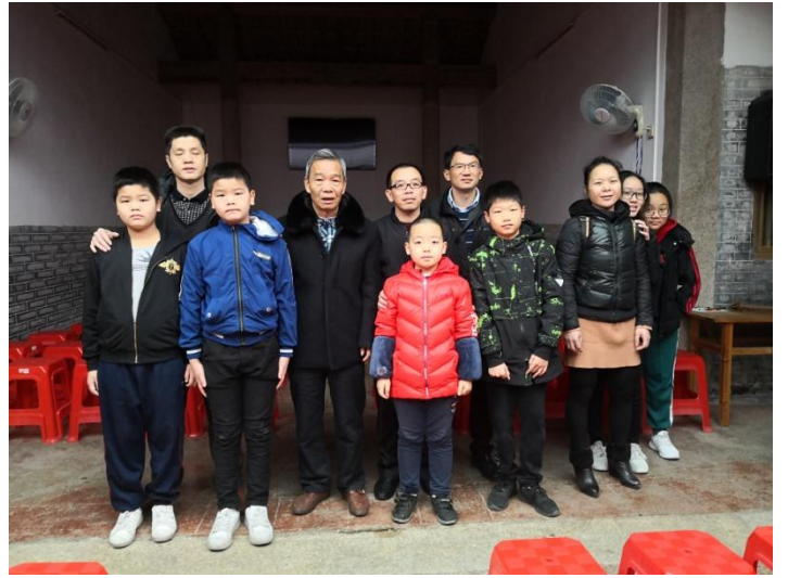
The parents and students work team