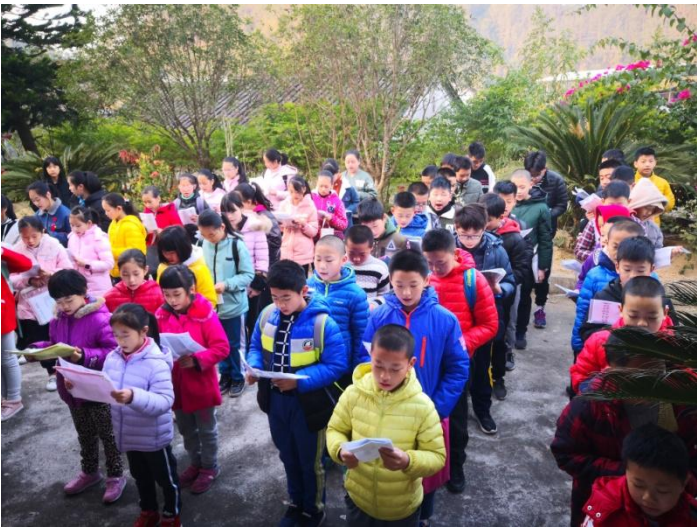
Early birds Morning Assembly