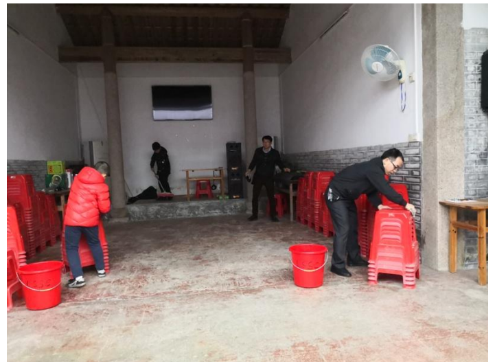
Parents and students helping

For the first time since I began running LSSC, I did not make any public announcement about the Winter Programme apart from posting a notice at LSSC announcing the schedule of the lessons and stating clearly it is entirely the responsibility of parents to ensure transport safety and attendance. Hence, I did not inform the local bus service that we were running a programme. I made this decision based on my experience that many parents – especially grandparents – because of the availability of direct public transport, sent their children to LSSC so that they can have “free time”. We had trouble with students who did not want to study. The villagers jokingly say “廖老师涨牛”. Ha ha ha ... I have become a cowherd!