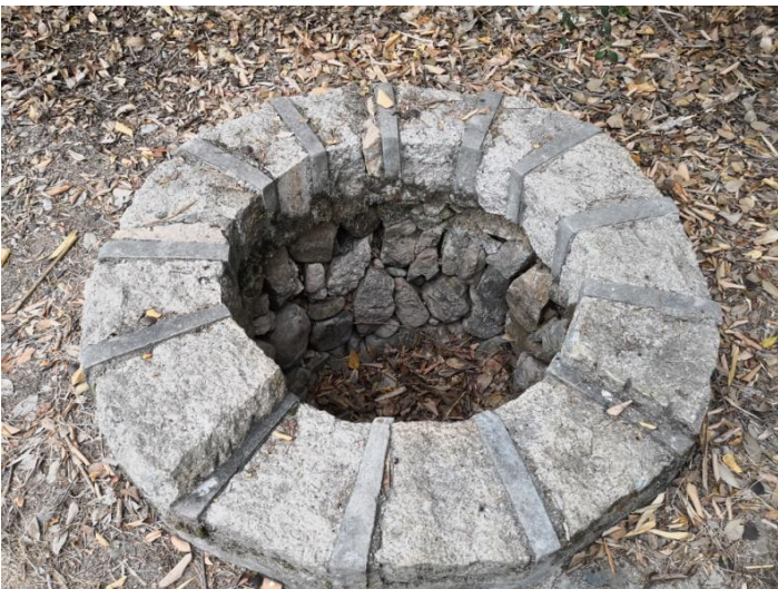
The Never Dry Well dried up