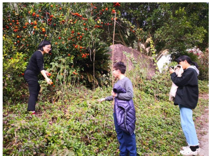
Here ...one for you