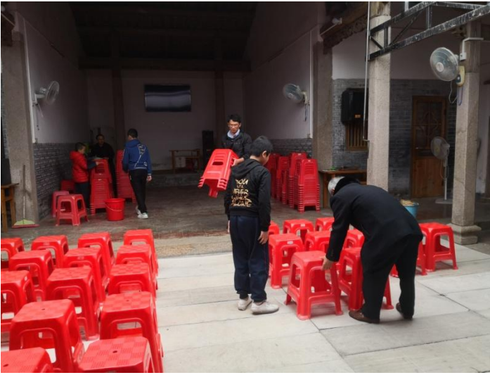
Parents and students setting up the hall