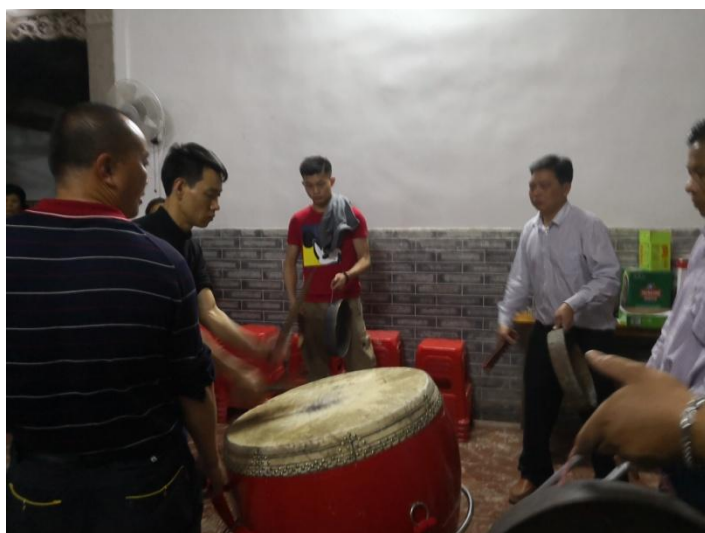
Drumming session at LSSC ...