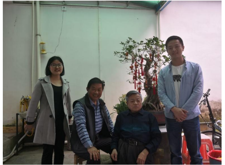
Present students with their father