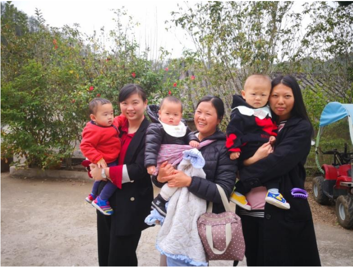
Former students with their sons